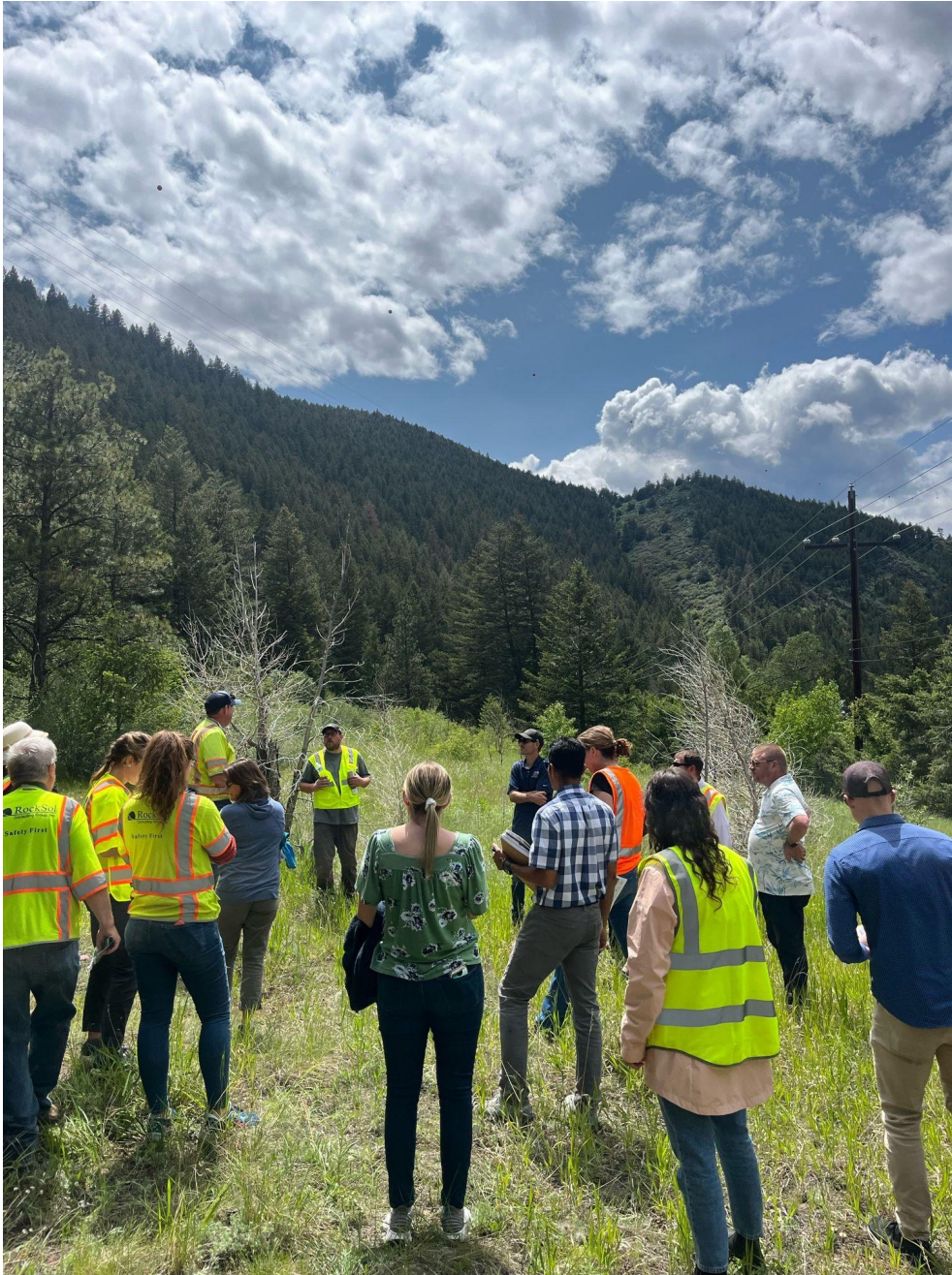
(Pictured Above: example of existing open meadow that will be used as a staging area for the Saddle Cut area construction.)